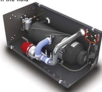
BOXED HYDRONIC L-II